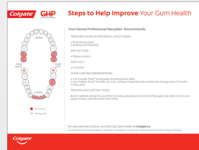
An example GHP report

The Gum Health Physical is a tool used by your dentist or hygienist to help you understand what parts of your mouth need extra attention.